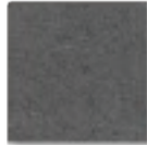
Medium Charcol Gray