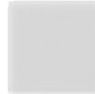
Windstar Silver Frost