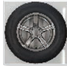
Aluminum Gunmetal Gray